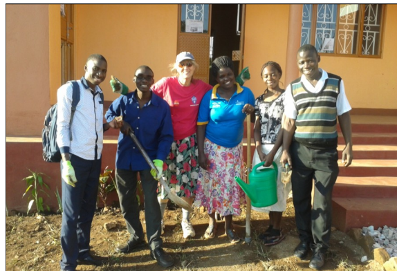
Beth's volunteer landscapers beautify the music building