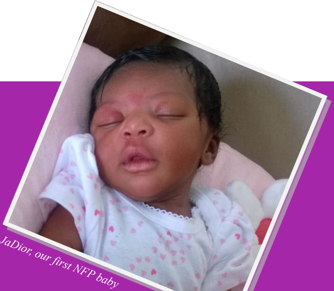
JaDior, our first NFP baby

Celebrating 25 years SERVING MOMS & BABIES 1992 - 2017