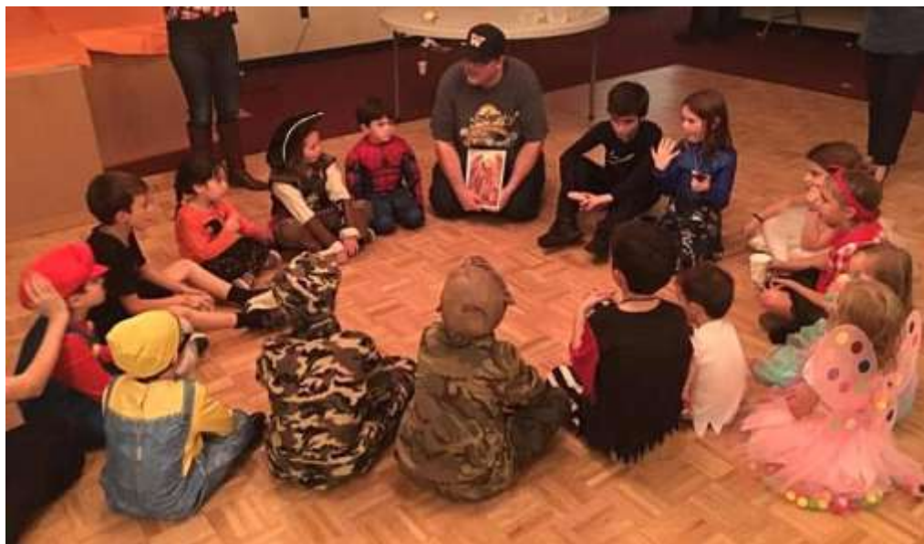
Harvest Festival Participants take a break from all the activities to learn about the Icon of the Raising of Lazarus