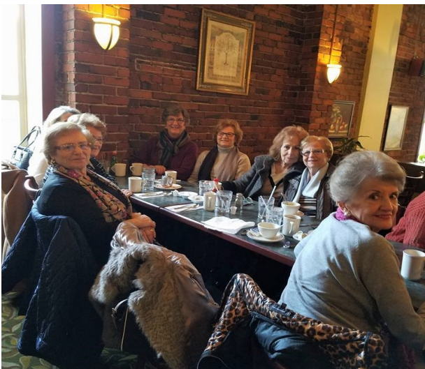
From February Yiayia & Friends' Luncheon at Costas on the Ave. restaurant.