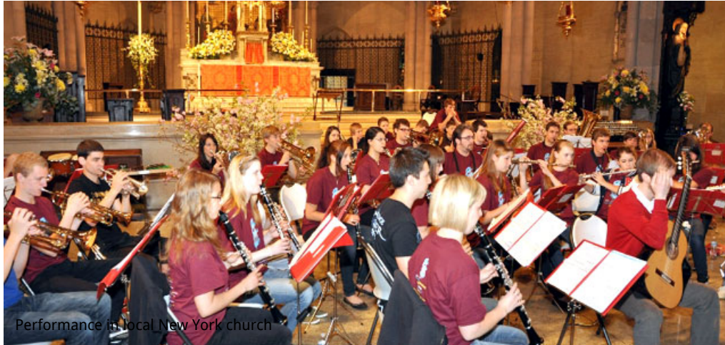
Performance in local New York church

"Having worked with World Projects for over 20 years, and knowing the new staff as well as I do, I can, without reservation, encourage any director to travel with World Projects. They will be well taken care of."