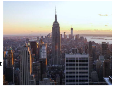
Skyline of Times Square

Groups performing in the afternoon will meet in the lobby of the hotel in performance attire with instruments. Arrive at Carnegie Hall for your group sound check. Following your sound check, store instruments in your warm up room.