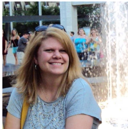
Director of Religious Exploration and Education