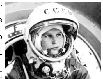
Valentina Tereshkova, the first woman in space, 1963