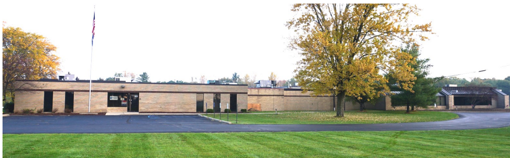
The Kiwanis Center

Interested in becoming a member? Please send an e-mail to MembershipGrowth@a2kiwanis.org or visit the website www.a2kiwanis.org .