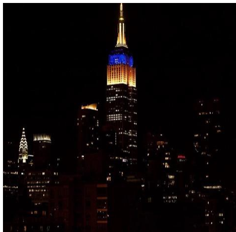
New York's Empire State Building celebrates Michigan's Big 10 Tournament Championship.