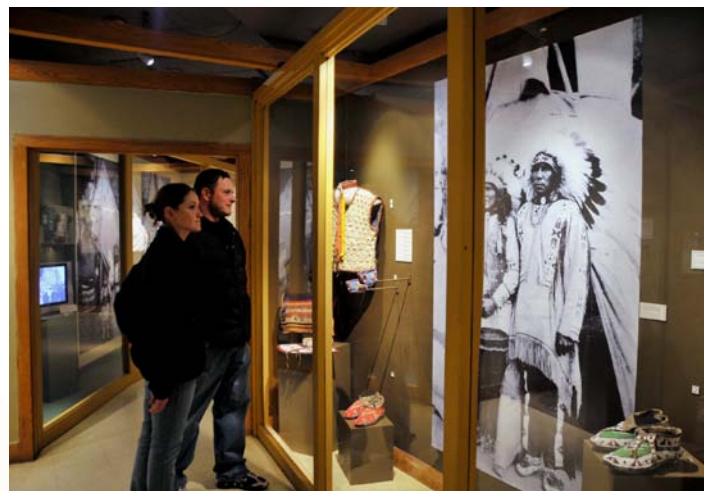
Exhibits at the Buffalo Bill Museum and Grave

Enjoy sunset over the Rockies and then the lights of Denver at one of the area's most popular visitor attractions...Lookout Mountain. The evening begins at the Boettcher Mansion, an Arts and Crafts era manor surrounded by Ponderosa pines. Short tours of the mansion will be offered as well as appetizers, beer and wine. A short walk through the woods will bring you to the Lookout Mountain Nature Center, which has exhibits about the mountain's ecosystem. Enjoy hands-on nature stops with furs to feel and telescopes for stargazing. And more appetizers, beer and wine. Then board a shuttle to the Buffalo Bill Museum and Grave for a FULL meal of buffalo barbecue, sides and desserts. Stroll through the exhibits about Buffalo Bill and the Old West, walk to Buffalo Bill's grave and see stunning views of Denver, pose for photos with Buffalo Bill and friends, and browse through Colorado's largest museum shop.