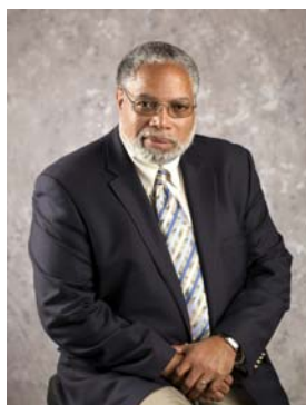
Lonnie G. Bunch III

Lonnie G. Bunch III, Founding Director, National Museum of African American History and Culture, Washington, D.C.