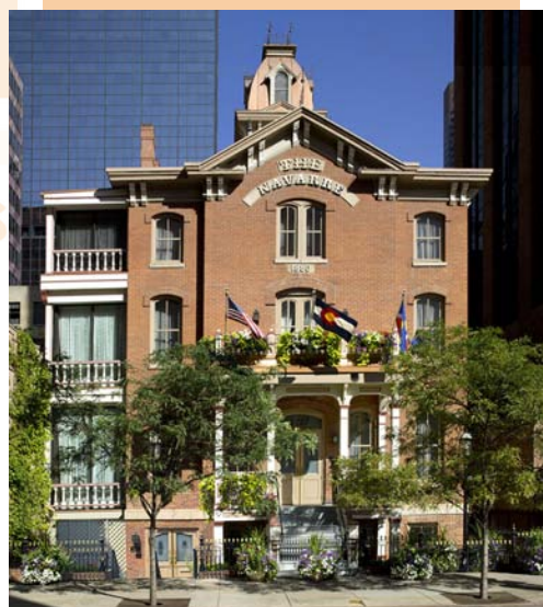
American Museum of Western Art in the historic Navarre Building