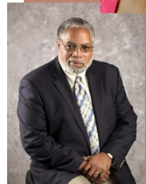
Lonnie G. Bunch III