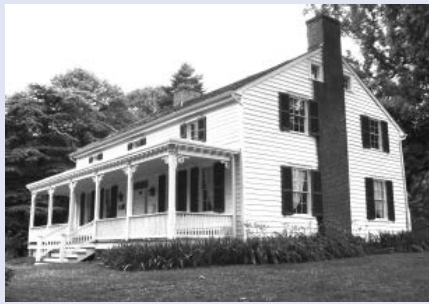
Cherry Hill Farmhouse 312 Park Avenue 703-248-5171

The Cherry Hill Farmhouse is located on Park Avenue, near City Hall and the Falls Church Community Center. The house hosts several special events, educational workshops, and seasonal programs annually. It is also available to rent for special occasions.