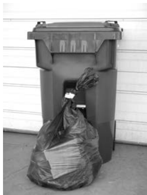
City-issued trash cart with properly-tagged excess trash bag.

Recycling is collected from curbside residential customers weekly on Wednesdays, year-round (except on observed City holidays). The City issued one green rolling recycling cart per address. These carts are the property of the City and must stay with the residence.