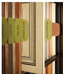
Individual sample doors have informative labels on back sides