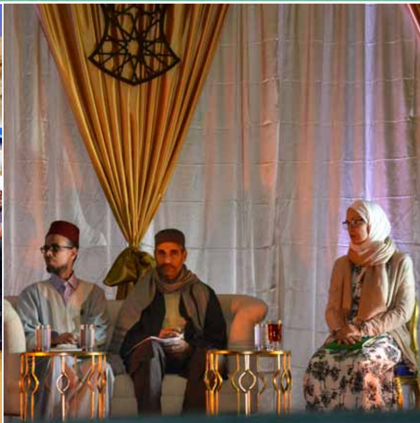
A Portrait of A Prophet Conference, January 2018