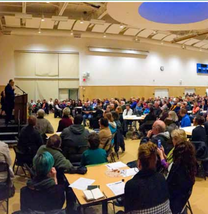
The Beloved Community Forum, November 2016