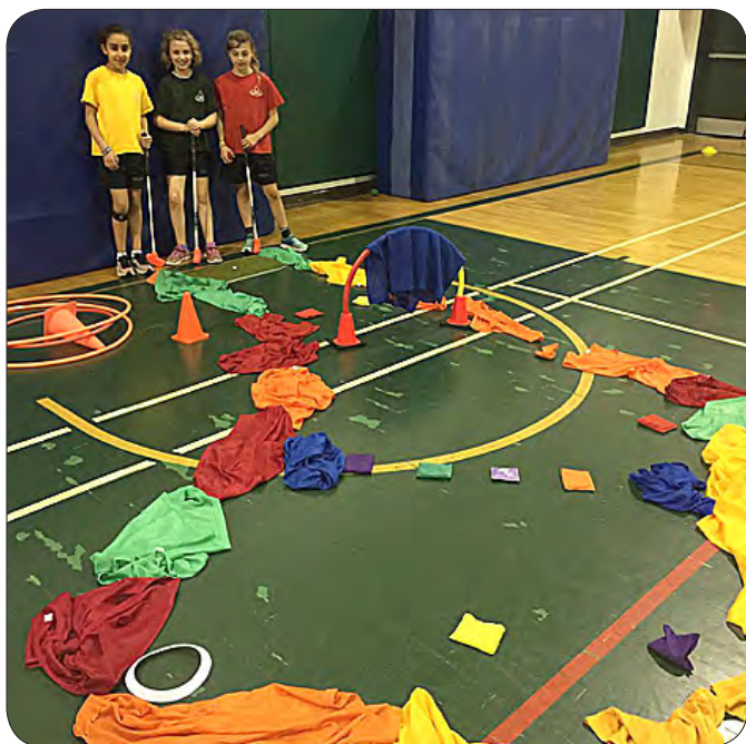
Golf in Schools @ Halifax Grammar School, Halifax NS

The NSGA was also present in the two Sport Nova Scotia Milk Sport Fairs. Together over 3000 students from the valley and HRM participated basic fundamental skill workshops, and teachers were introduced to the Golf in Schools program.