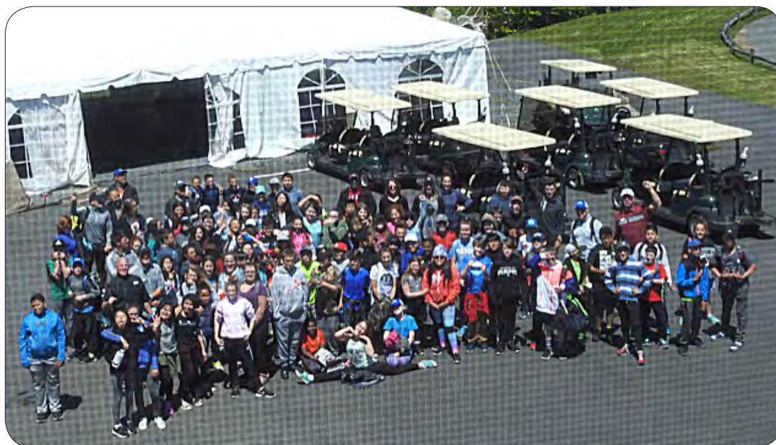
Golf In Schools field trip, Links at Brunello, Timberlea NS

Despite the decrease in Future Links program execution, and participation, there were many highlights of the 2018 summer. During the May and June, the NSGA conducted Golf in Schools, and Mobile Clinics to over 419 participants in the Cape Breton