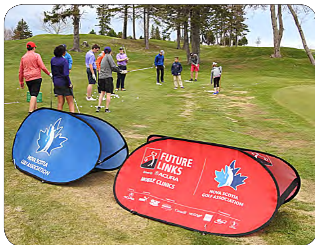
Mobile Clinic at Seaview Golf Club, Sydney NS