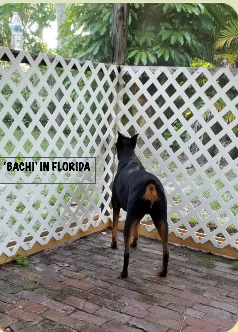
'BACHI' IN FLORIDA