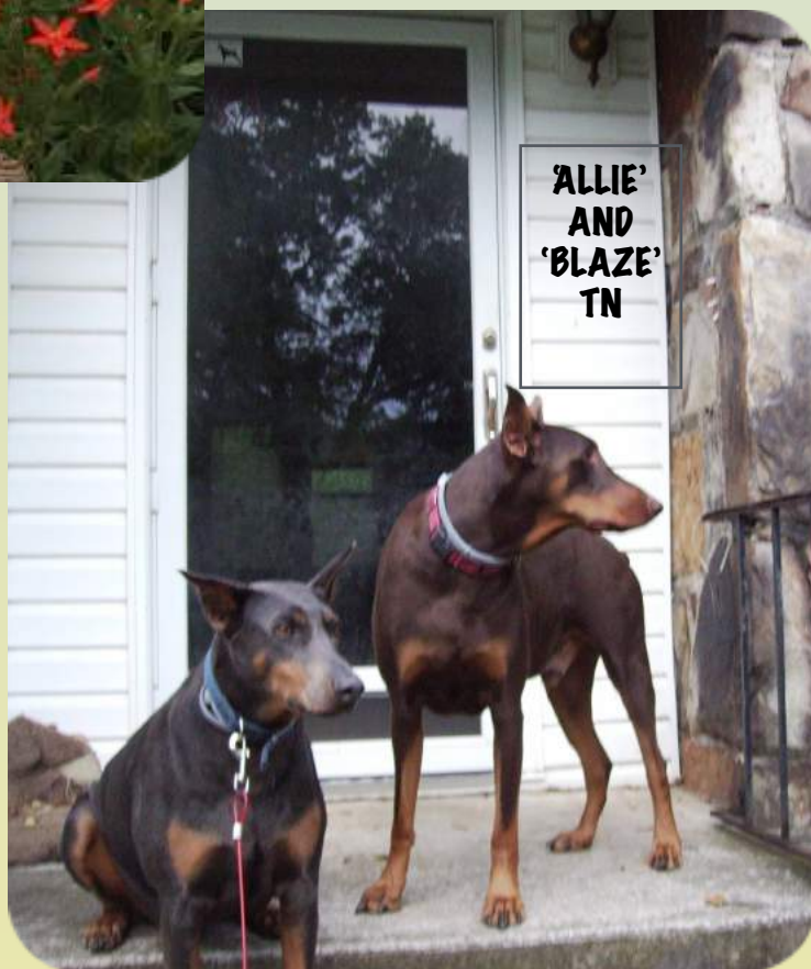
'ALLIE' AND 'BLAZE' TN