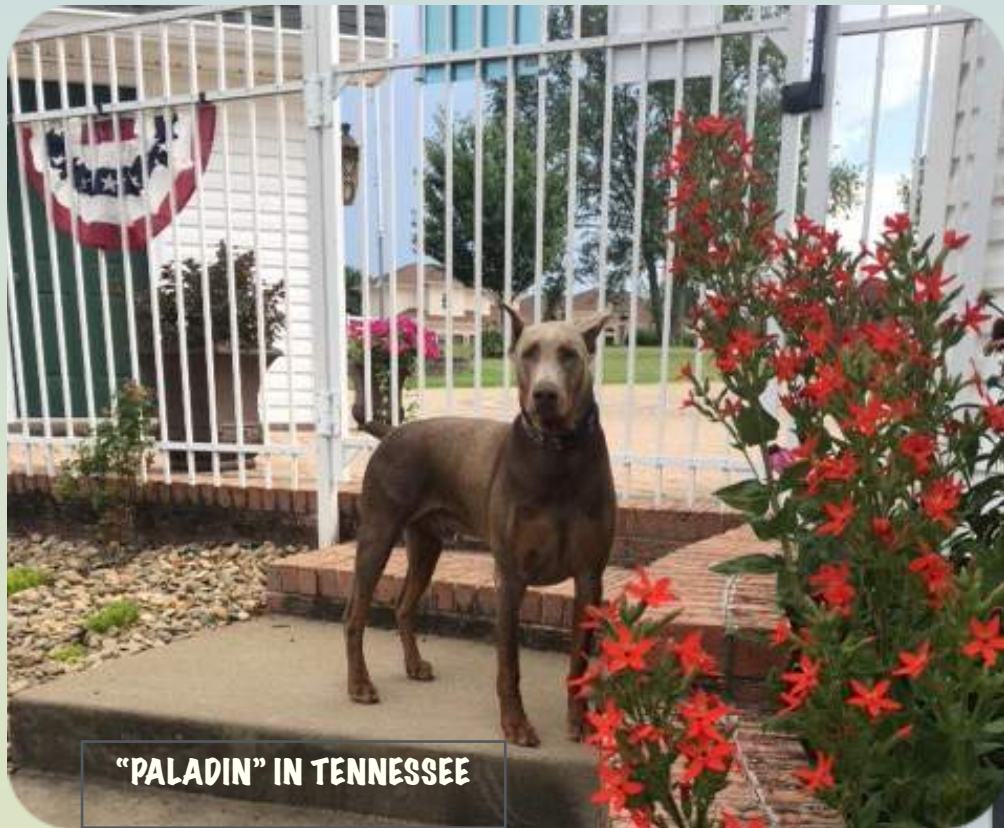
"PALADIN" IN TENNESSEE