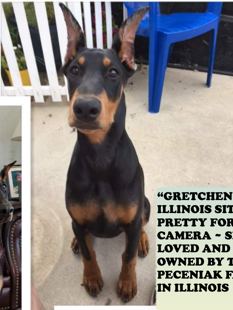
"GRETCHEN" IN ILLINOIS SITS PRETTY FOR THE CAMERA ~ SHE IS LOVED AND OWNED BY THE PECENIAK FAMILY IN ILLINOIS ~