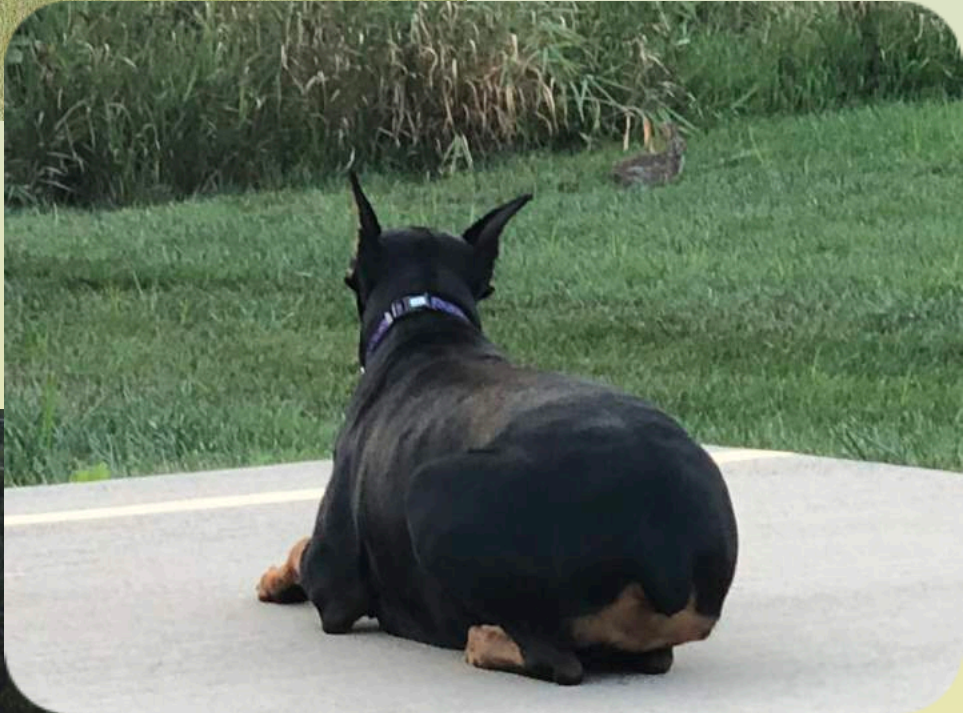
Right: "Lexi" in Iowa waits for the bunny to move