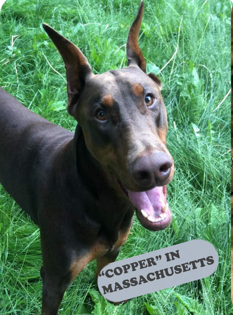
"COPPER" IN MASSACHUSETTS