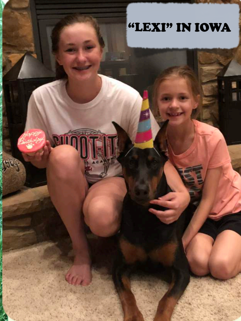
"LEXI" IN IOWA