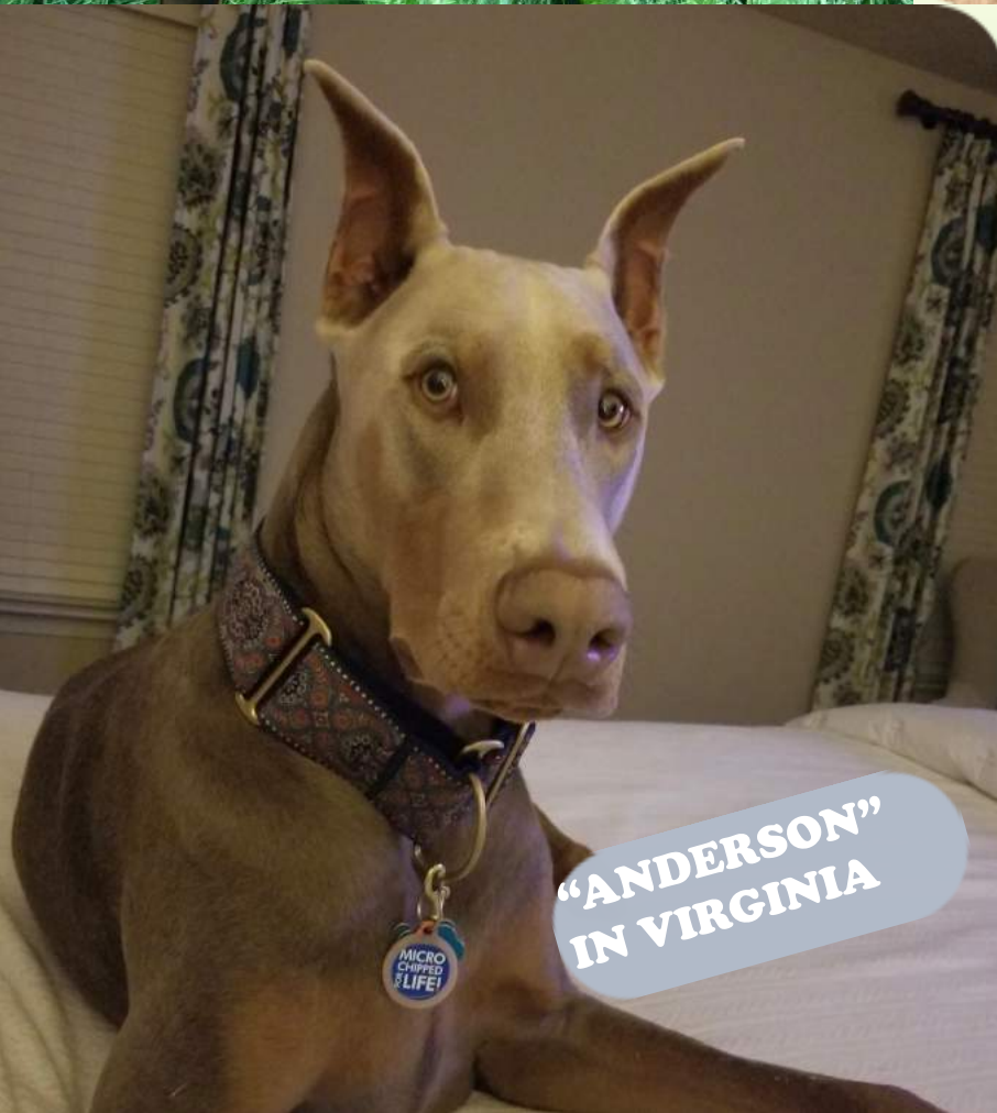
"ANDERSON" IN VIRGINIA

THESE LITTER MATES JUST CELEBRATED THEIR 2ND BIRTHDAY IN AUGUST ~