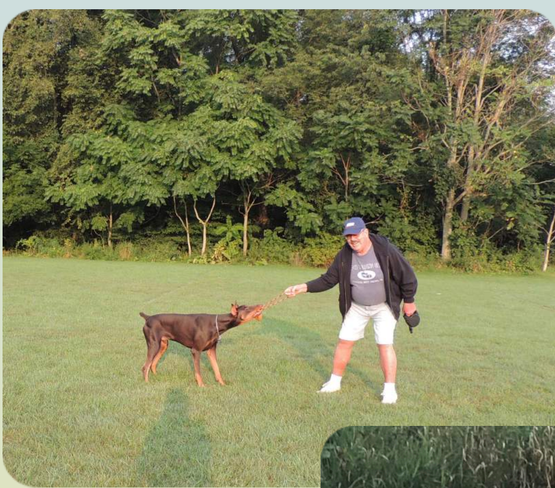
Left: "Thor" in Ohio plays a game of tug with dad