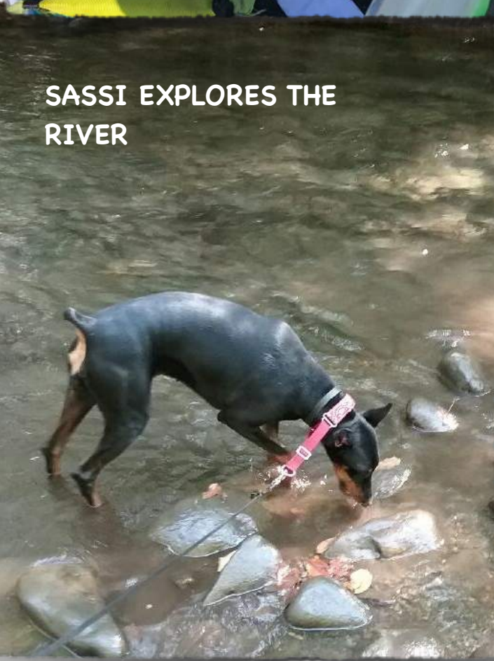
SASSI EXPLORES THE RIVER