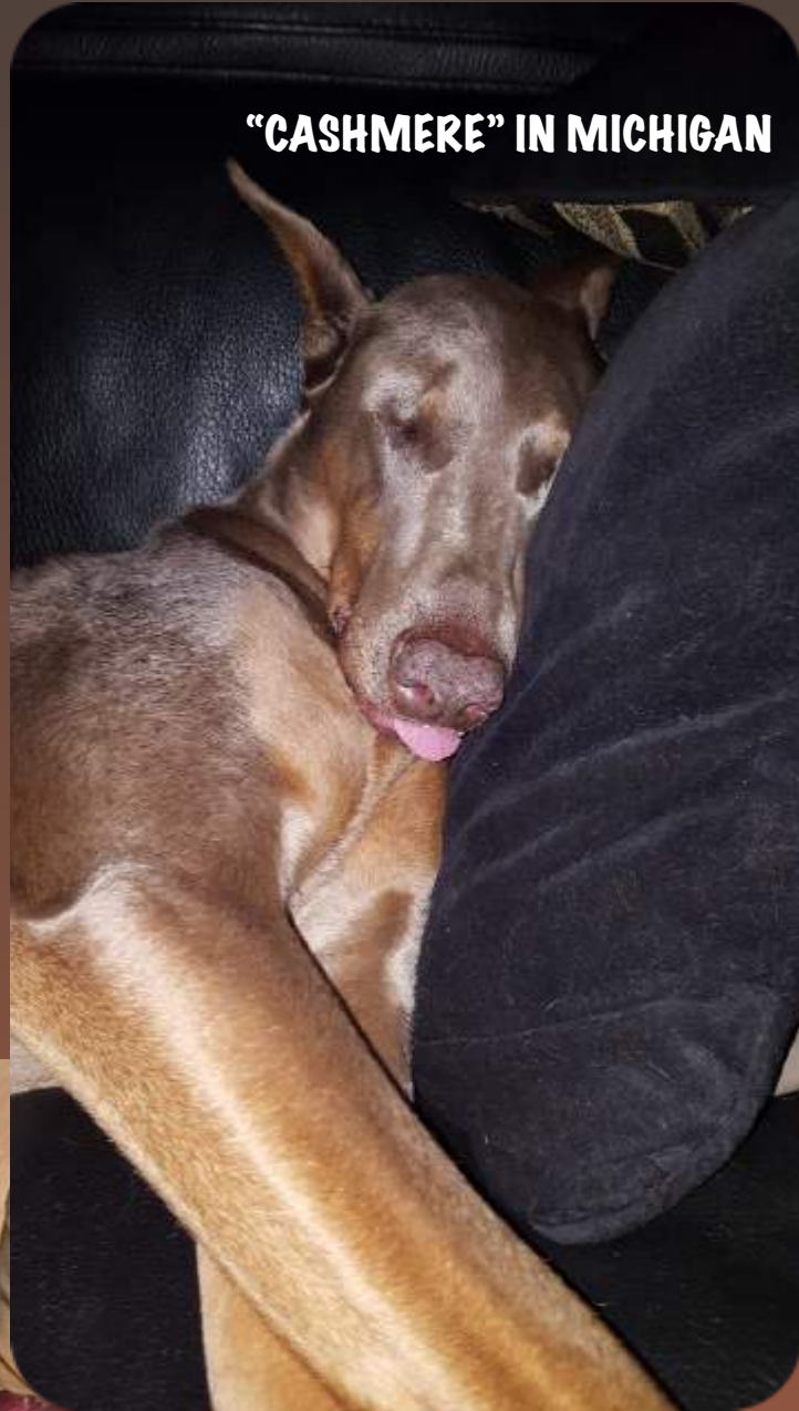
"CASHMERE" IN MICHIGAN