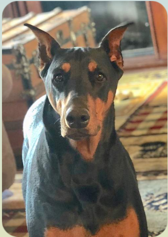
"ECHO" IN WYOMING