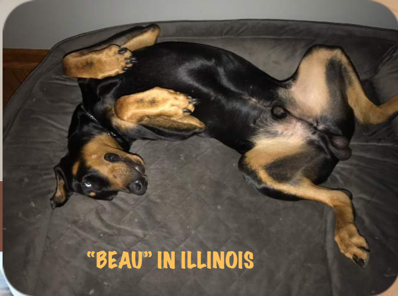
"BEAU" IN ILLINOIS