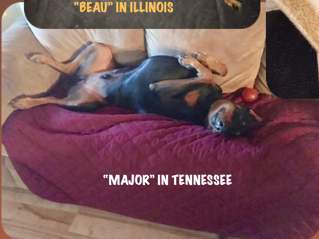
"MAJOR" IN TENNESSEE