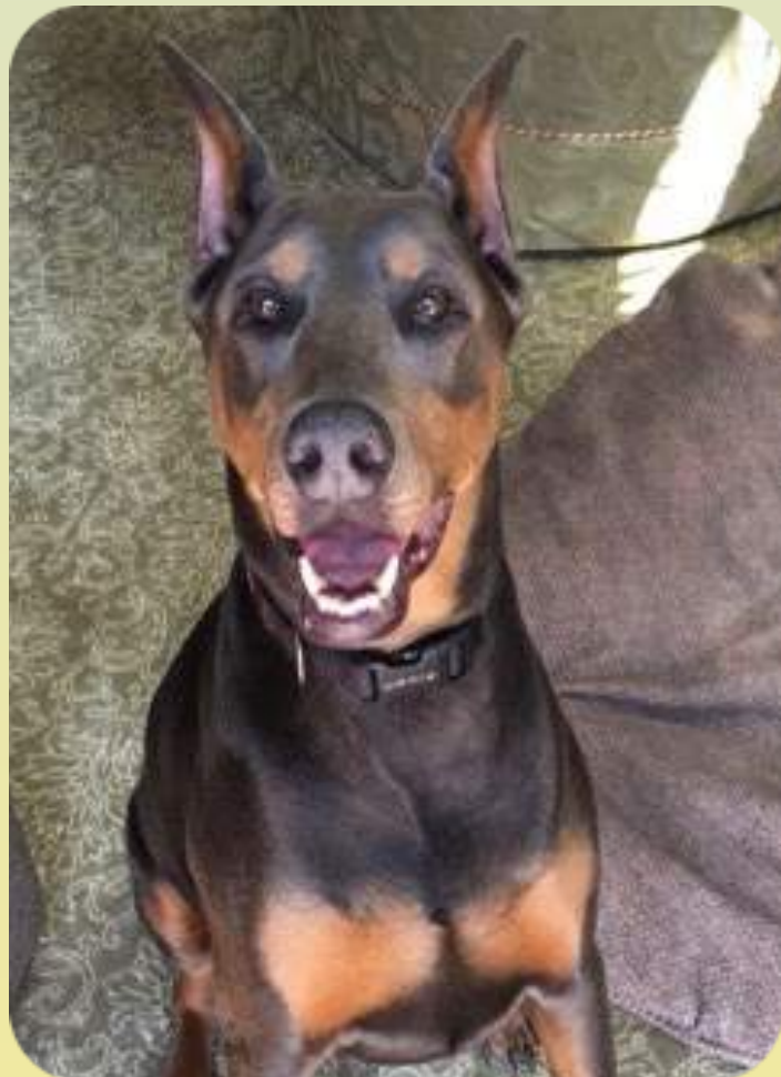
"SILHOUETTE" IN TENNESSEE