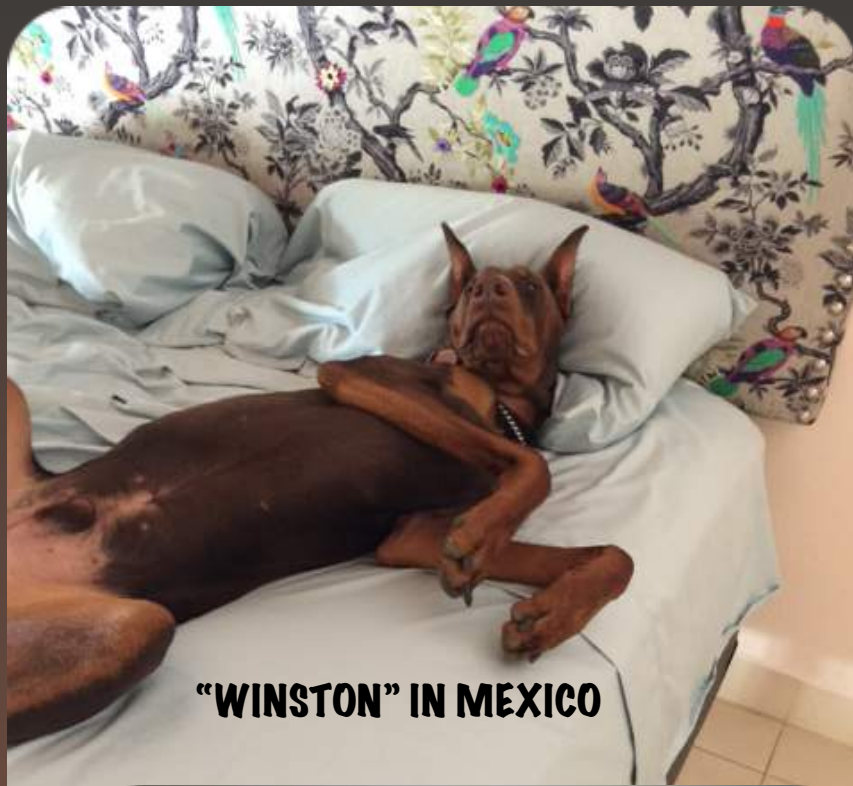
"WINSTON" IN MEXICO