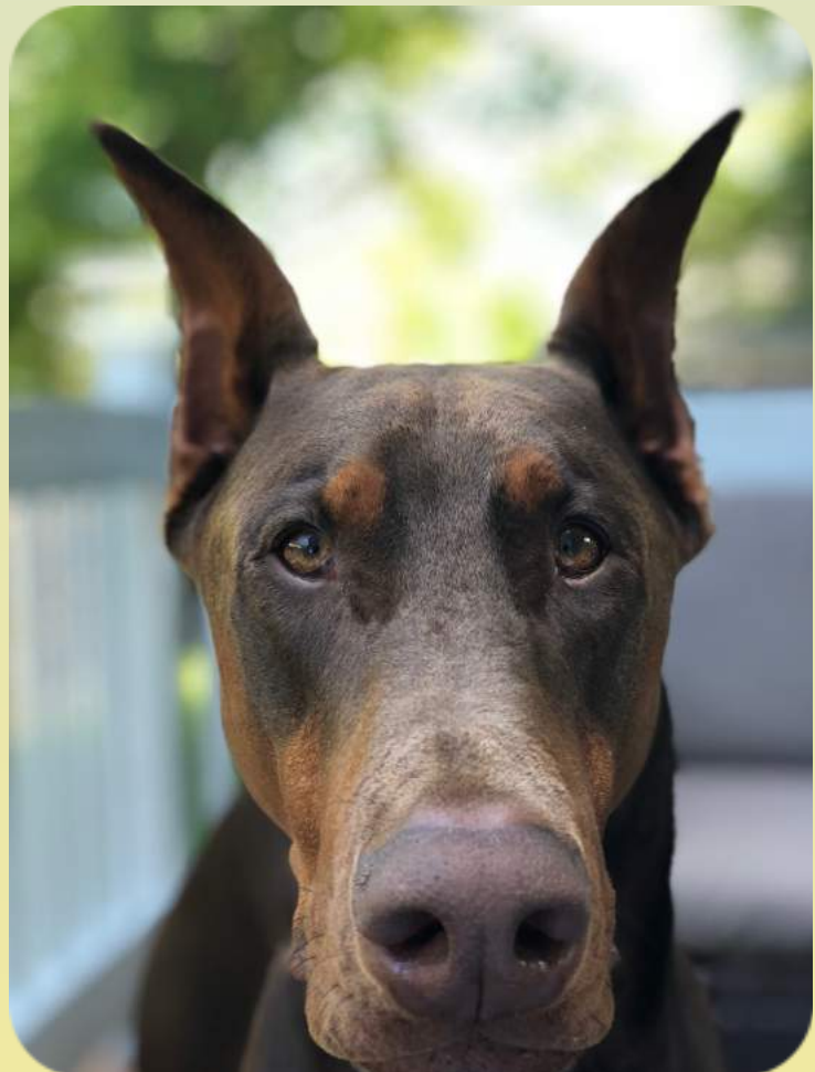
"COPPER" IN MASSACHUSSETTS