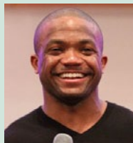
Maurice Clarett | Speaker, College Football National Champion and Philanthropist

Hear how Maurice Clarett went from a tumultuous life outside of football, including his dismissal from Ohio State, several arrests, and imprisonment, to joining mental health advocates to promote the expansion of Medicaid in Ohio after suffering from depression.