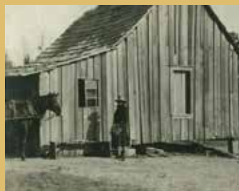
St. James Lutheran School, Buena Vista, circa 1917