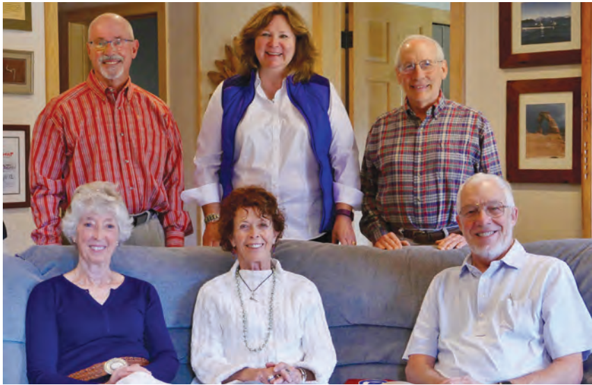
Local leaders in Ouray County are excited to build their own community fund and distribute grants annually.