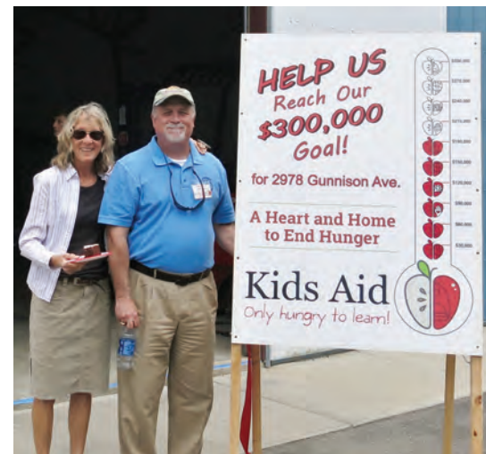
Kids Aid moved into their new warehouse in June.

The Kids Aid Backpack Program has been growing steadily for almost a decade. They started in one school, providing weekend food provisions in backpacks to 40 students. Over the next eight years they expanded to serving 2,200 students a week through all schools in District 51.