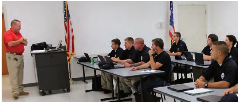
DMTC's Law Enforcement Academy prepares students for careers in criminal justice and law enforcement.

In 2016, our Community Foundation awarded over $780,000 in scholarships from 42 different funds to 110 students. We also manage endowed scholarships for Colorado Northwestern Community College and Delta-Montrose Technical College.