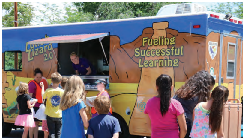
Feeding hungry kids... one neighborhood at a time.

In addition to our efforts to feed hungry kids in Mesa County, our Community Foundation supported summer food programs in Fruita, Rifle, Eagle County and Delta.