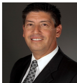
ASQLA Chair's message for April 2018 Newsletter