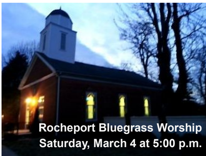
Rocheport Bluegrass Worship Saturday, March 4 at 5:00 p.m.

itself. You will see that there are so many ways to help, from organizing the clothes to making runs in the big truck for furniture. Any time that you can give to make the Habitat Sale another awesome success is greatly appreciated.