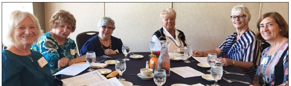
Morris Park Country Club