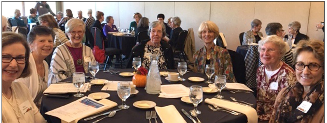
Happy Faces, Happy Friends