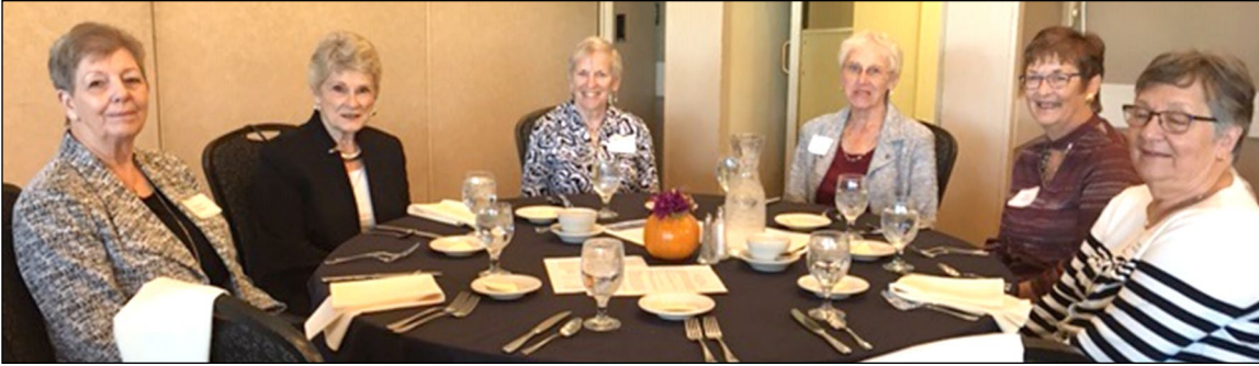
Fall Luncheon, October 4