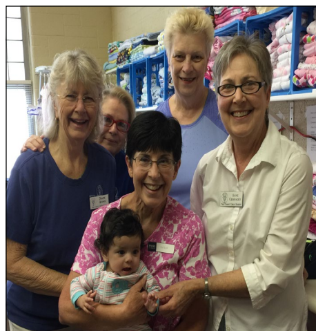
One of our littlest clients with Layette ladies

Unfortunately, even with all this, the Collection Bins and many of the individual-sized containers are once again empty. Most sizes from 18 months to size 20 can use sweaters, pajamas, and pants. Especially needed are short and long sleeved shirts for boys' sizes 6 through 12 and girls' sizes 14 to 20, and coats and jackets any size, boys and girls.