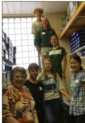
Ladder needed to store boxes up high.