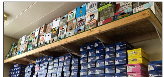
Shoe room high shelves complete project.