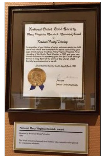
Puddy's National Mary Virginia Merrick Memorial Award