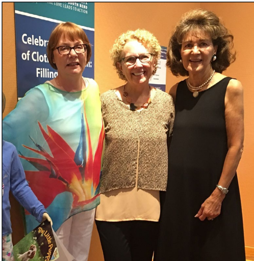
National Board Members