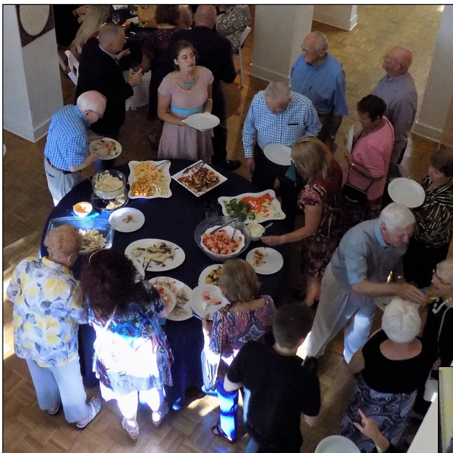
Buffet table (from above)