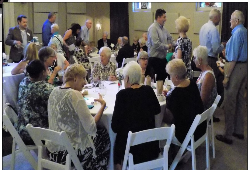
Heavy hors d'oeuvres and friends