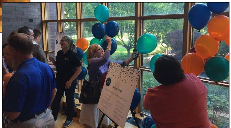
Gift card balloon popping