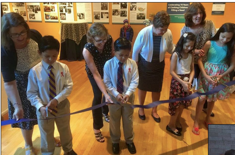
Cutting ribbon to open celebration