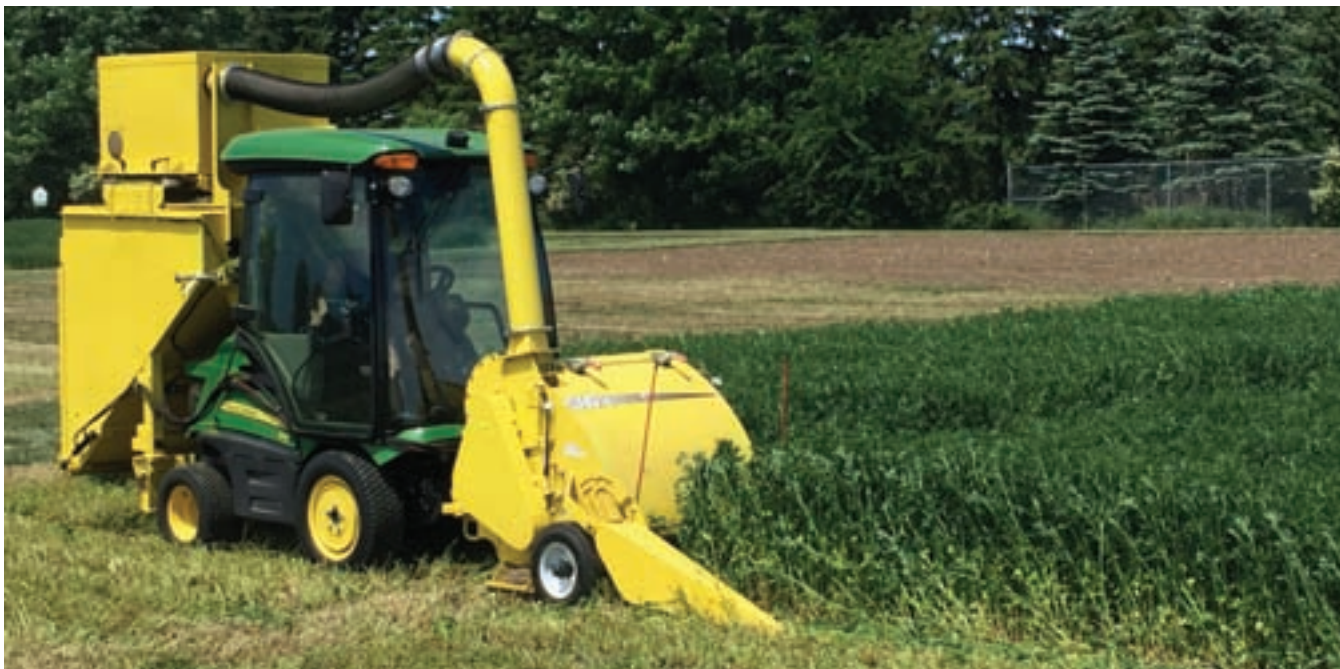
Quality samples are taken from every plot, assessing diseases, stand establishment and re-growth, among other observations.