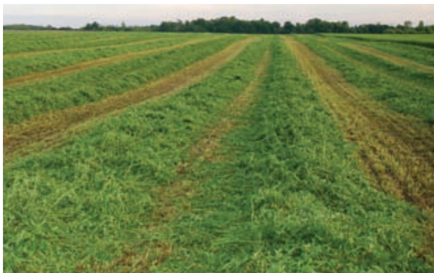
It's not necessarily that forage quality is in decline, but that other crops are advancing faster.