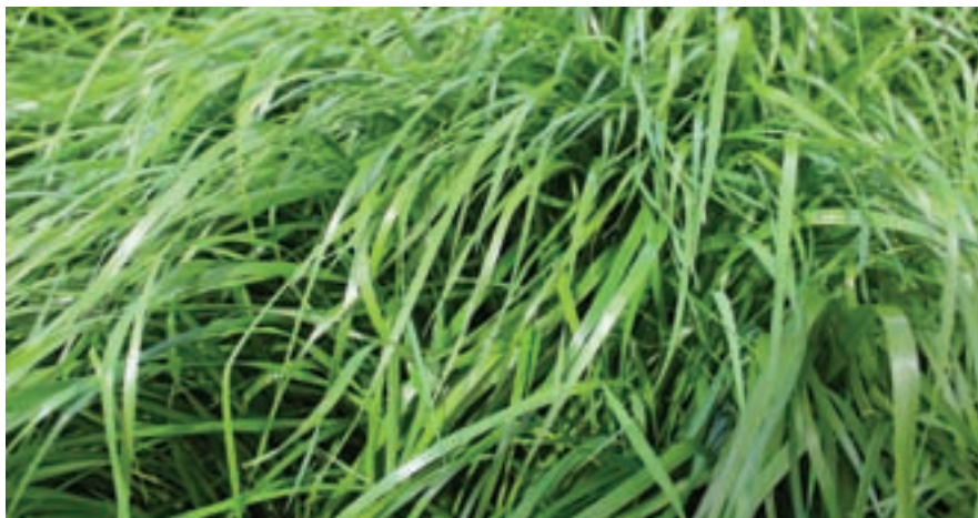
Festulolium is a new species consisting of two hybrids — crosses of different ryegrass species and different fescues.

There’s also a hybrid ryegrass — a cross between perennial ryegrass and an annual ryegrass, although festulolium is expected to eclipse a lot of the ryegrass hybrids. ■