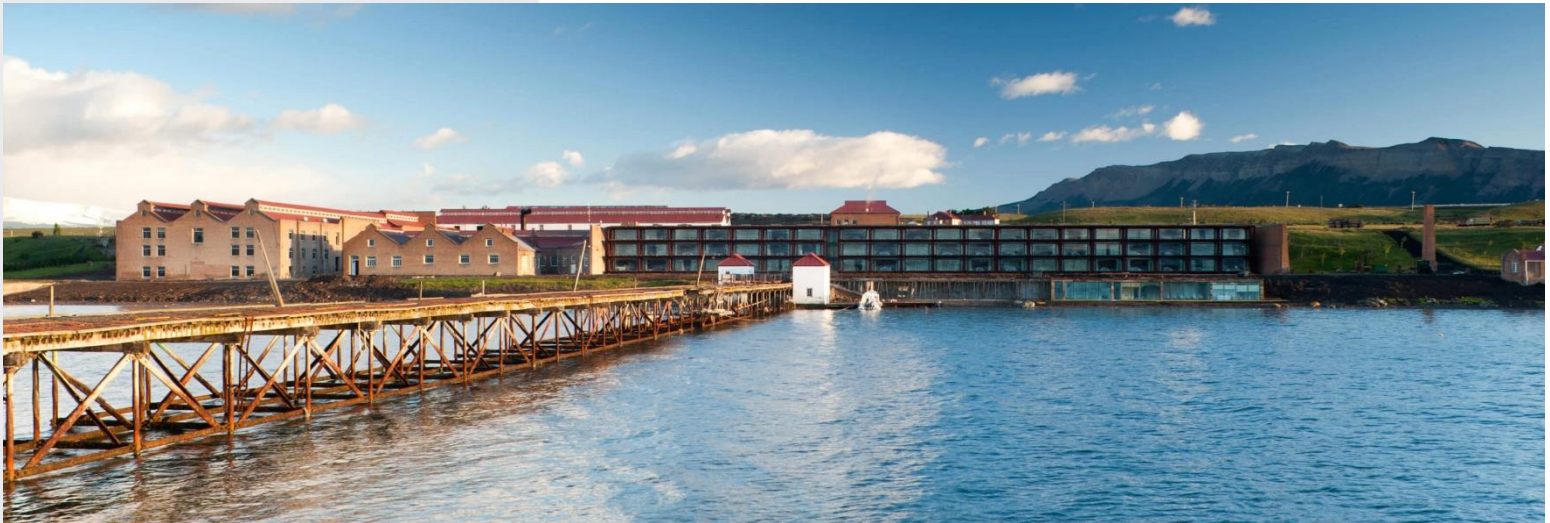
Base Torres del Paine

Exclusive benefits to immerse yourself in the gastronomic essence of the area, explore the landscape or simply live a moment of total relaxation. The programs they offer are the perfect fusion between luxury and nature.