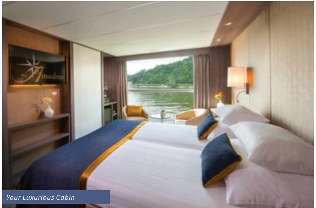
Your Luxurious Cabin

Today you will enjoy a tour of the city of Munich. Admire architectural wonders like the Old Town Hall, St Peter's Church and the Munich Residenz; stroll through the lively Viktualienmarkt; and see the world-famous Hofbräuhaus beer hall. Accompanied by an expert guide, you'll have ample opportunities to learn more about Munich's history, cultural heritage and beer-