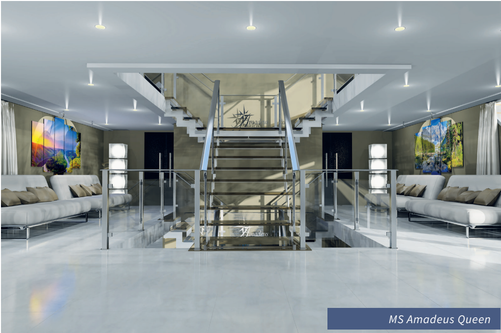
MS Amadeus Queen

This new vessel follows the award-winning model of the AMADEUS Silver ships but offers even further innovative developments. The popular concept of spaciousness has been maintained. This includes not only generous public areas but also spacious cabins: 12 large suites impress with an outdoor balcony and a cozy reading corner whilst the 69 standard cabins mainly have panoramic window fronts which can be automatically lowered and luxurious bathrooms. A new on-board highlight is the indoor pool, the roof of which can be opened in fine weather. In the evenings, this area may also be used for informative talks, functions and cinema showings.