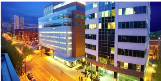
University City Science Center 3711 Market Street Philadelphia, PA

Organized by: The Mid-Atlantic - Eurasia Business Council