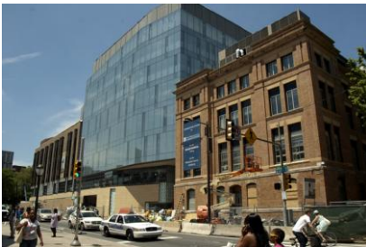
The Wistar Institute 3601 Spruce Street Philadelphia, PA