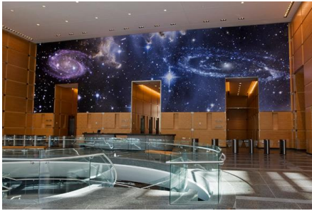
Comcast Center 1701 John F. Kennedy Boulevard Philadelphia, PA