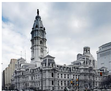
Philadelphia City Hall Broad Street and Market Street