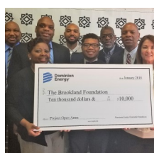
Brookland Foundation receives Dominion Energy Grant (January 26, 2018)