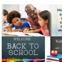
Tutorial Sessions Start (September 10, 2018)