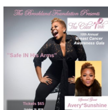
The Color Pink: Breast Cancer Awareness Gala "Safe IN His Arms" (October 10, 2018)