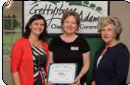
SpiriTrust Lutheran Home Care & Hospice Inc., Gettysburg – 10 years