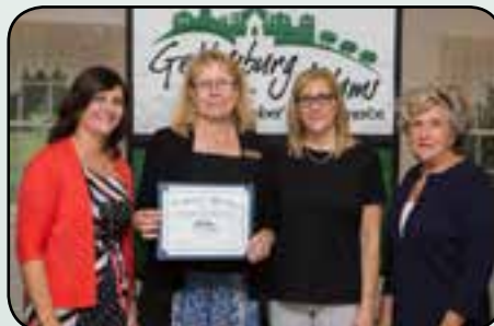
Lower Marsh Creek Presbyterian Church, Gettysburg – one year