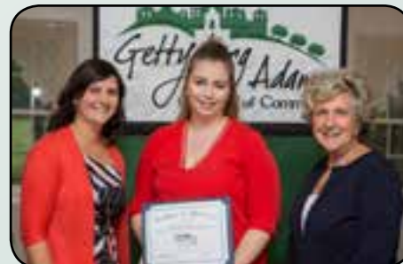
Farnsworth House Inn, Gettysburg – one year