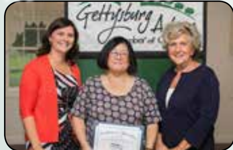
Brown's Ranch, Gettysburg – 15 years