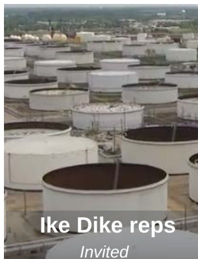
Ike Dike reps Invited