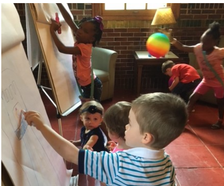
Children of New Students Play Together at "Pre-union" Picnic