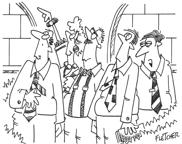
OUR OLDER DEMOGRAPHIC INTERPRETED "AN ELECTRONIC PRESENCE TO INCREASE VISIBILITY" AS STRINGING TWINKLE LIGHTS AROUND THE STEEPLE.

Intentional efforts to increase visibility. Effective approaches are size-specific. Every small church can creatively send the message to newcomers and the community—"we are here, we care about you, and we welcome you!" An electronic presence (website, Facebook, Instagram) establishes a virtual welcome mat. A well-maintained and lighted church building signals a physical "home" that anticipates visitors.