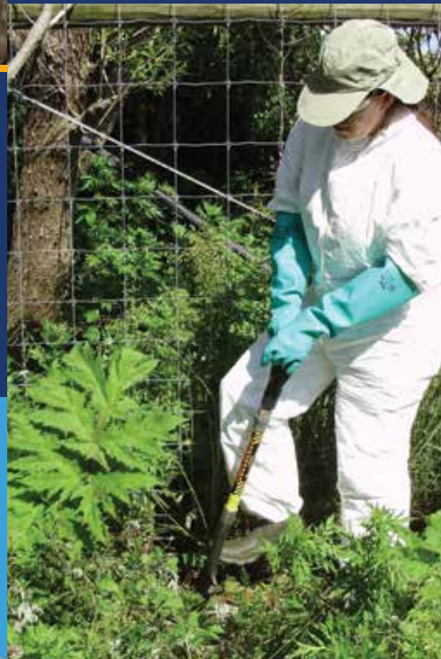
Cutting the plant root