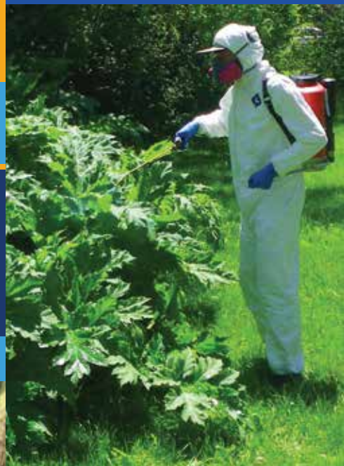
Spraying with herbicide

DEC is working hard to control giant hogweed.