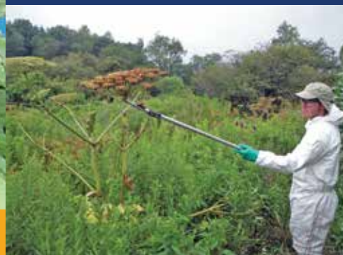
Removing seed heads

Its sap can cause painful burns, permanent scarring and even blindness.