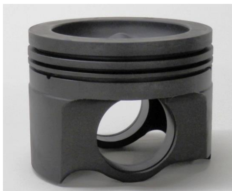
Figure 1: IPDSteel friction welded piston for C18/C32 engines

IPDSteel® friction welded pistons are packaged in IPD Cylinder Kits (piston, rings, pin, cylinder liner, and retainers). IPD offers these kits with your choice of cylinder liners...original style or IPD's optional "crevice seal" design (available exclusively from IPD). IPD's crevice seal design provides a more secure fitment, reducing liner movement and extending the life of the o-rings and the lower bore in the block.