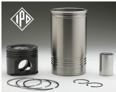
Figure 2: IPD cylinder kit for C27 engines