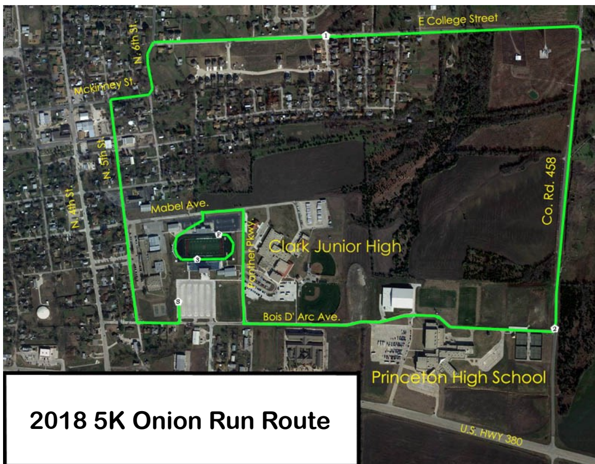
2018 5K Onion Run Route