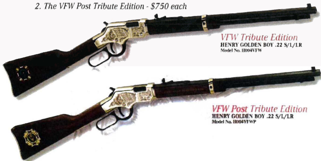
VFW Tribute Edition HENRY GOLDEN BOY .22 S/L/LR Model No. H004VFW