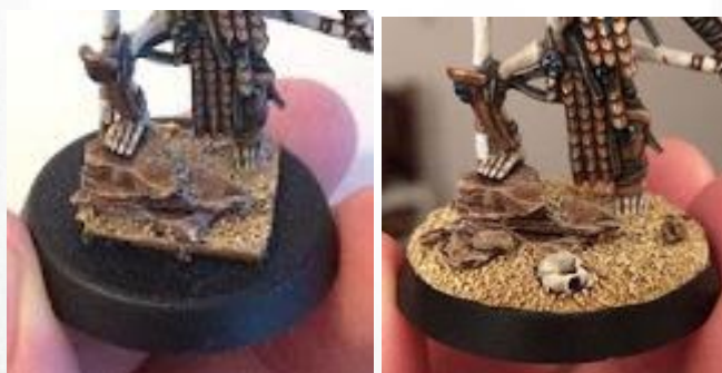
Before build up