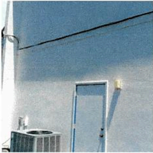
House Body 07/07/2017 11:37 AM