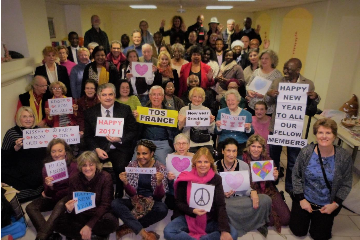
A Happy New Year to each and every worker around the globe from the TOS in France.