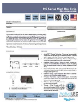
HS STRIP SPEC SHEET