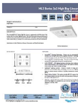
HL2 LINEAR SPEC SHEET