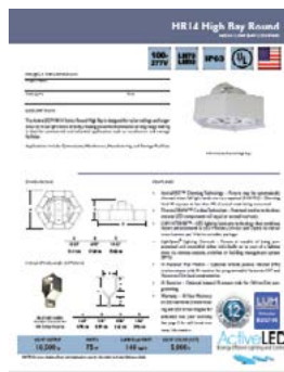
HR14 ROUND SPEC SHEET