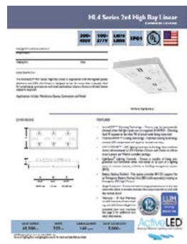
HR4 LINEAR SPEC SHEET