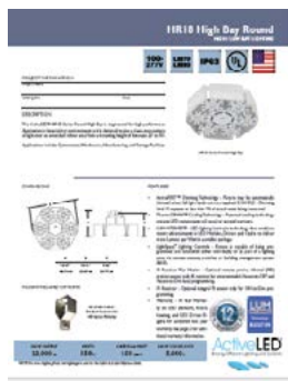
HR18 ROUND SPEC SHEET