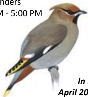
In Memory of Pico April 2006 - September 2016

NONPROFIT ORG US POSTAGE PAID PINCKNEY, MI Permit no. 823