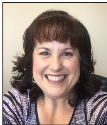
Director of Evangelization, Catechesis, and Youth Formation, Diocese of Springfield Cape Girardeau