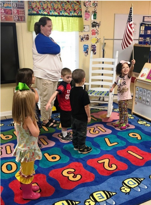
(Left) The Pre-K classes begin their patriotic education early by learning to say the Pledge of Allegiance to the Flag of the United States of America.

Everyone at KDS is excited in their own way for a most successful school year!