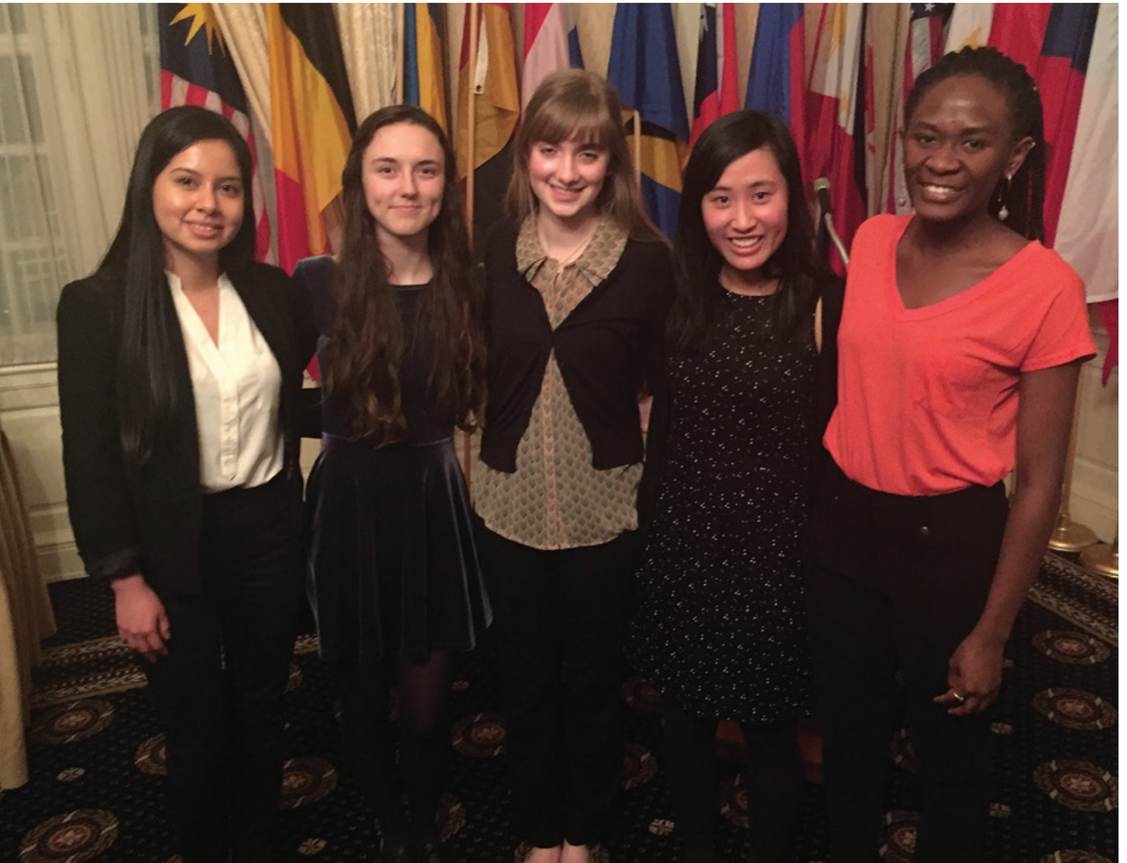
2016 SCHOLARSHIP WINNERS

JOIN US AS WE HELP BUILD THE NEXT GENERATION OF INTERNATIONAL BUSINESS LEADERS