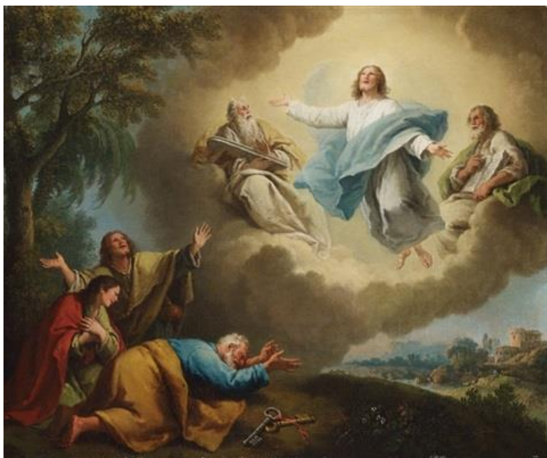
Landscape with the Transfiguration of Christ, Francisco Zuccarelli, Italian, 1702-1788