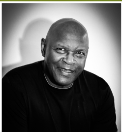
With Special Guest VIDA BLUE former MLB Left-Handed Pitcher and Six-TIme All-Star