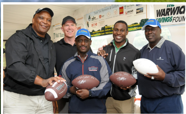
We welcome back NFL NY Giants' Alumni Ottis "OJ" Anderson, Stephen Baker and Howard Cross and NY Jets' Alumni, Tony Richardson .

former PGA Tour Professional and current host of Golf Channel's "Morning Drive"