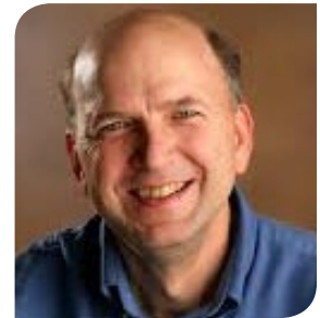
Terry Pluto Author of 12 books, including "The Comeback: LeBron, the Cavs & Cleveland" (2016)

WHEN: Thursday, October 27, 2016 from 5:30 PM to 8:00 PM